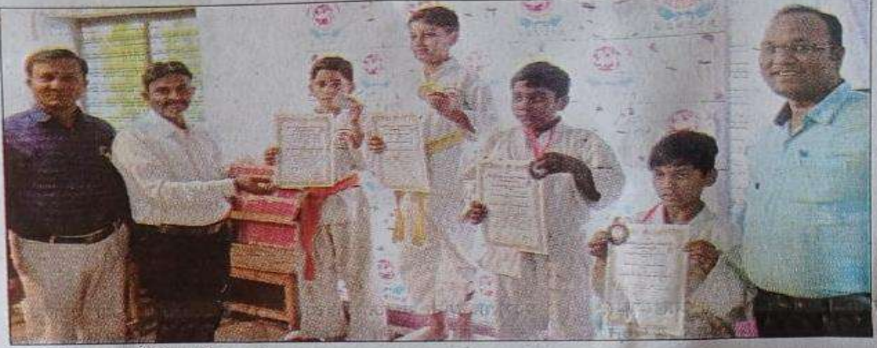
स्पर्धेतील यशस्वी विद्यार्थी