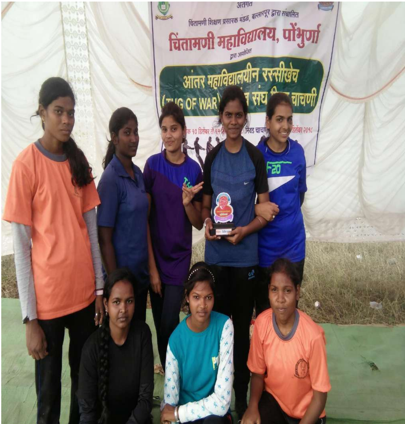
MJF COLLEGE WON 2 ND PLACE IN INTER COLLEGE TUG O WAR (GIRLS ) COMPETITION ORGANISED BY GONWANA UNIVERSITY GADCHIROLI : 2018-2019