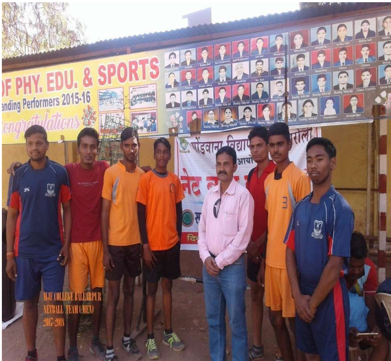
MJF COLLEGE NETBALL (BOYS ) TEAM PARTICIPATED IN INTER COLLEGE COMPETITION ORGANISED BY GONDWANA UNIVERSITY , GADCHIROLI . 2017-2018